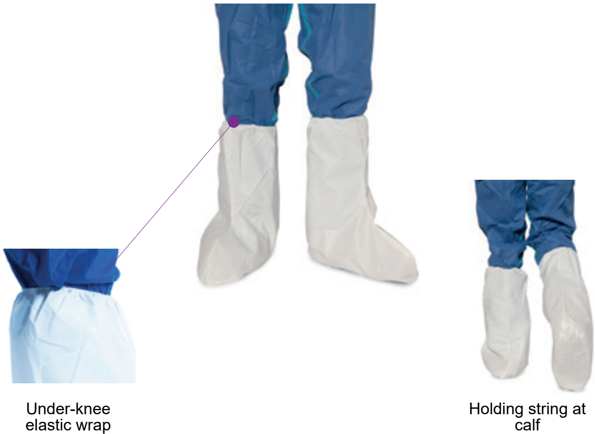
Under-knee elastic wrap